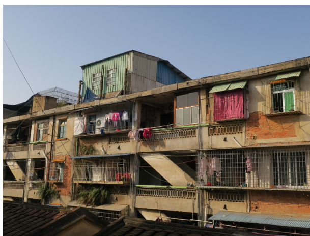
Fig 11. Hut assembled from tin plating on the rooftop of the apartment building